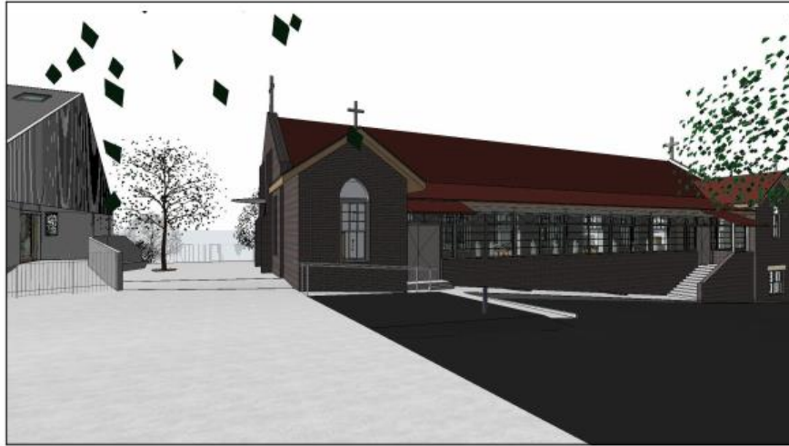
VIEW FROM MAIN APPROACH