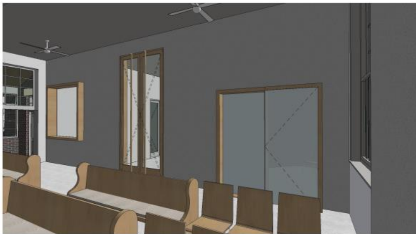
VIEW TOWARD CONFESSINAL