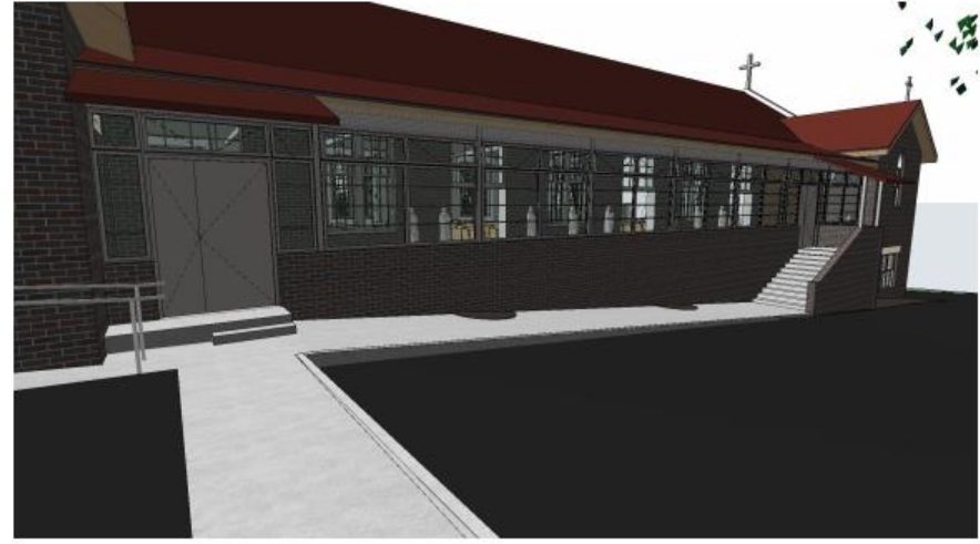
SIDE ACCESS AND CARPARK