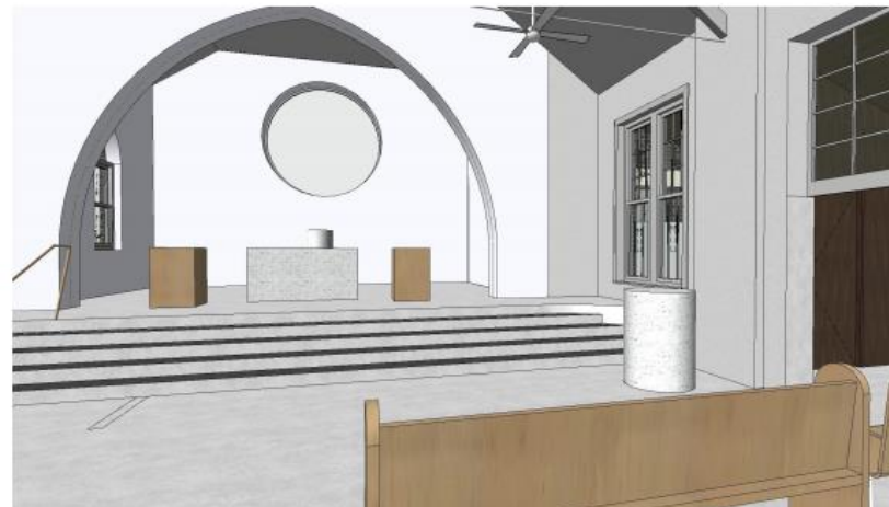
TOWARD SANCTUARY AND BAPTISMAL FONT