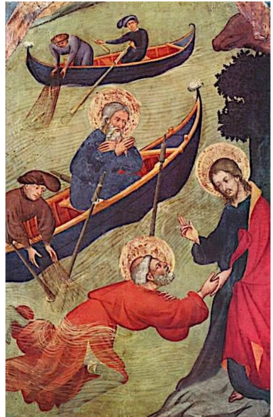
Lluís Borrassà, Jesus Supports Saint Peter on the Water. 1411

O Jerusalem, glorify the Lord, who gives you your fill of finest wheat.